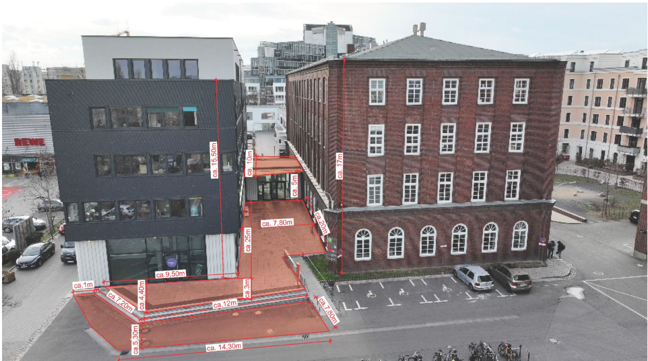
Diagram with approximate dimensions